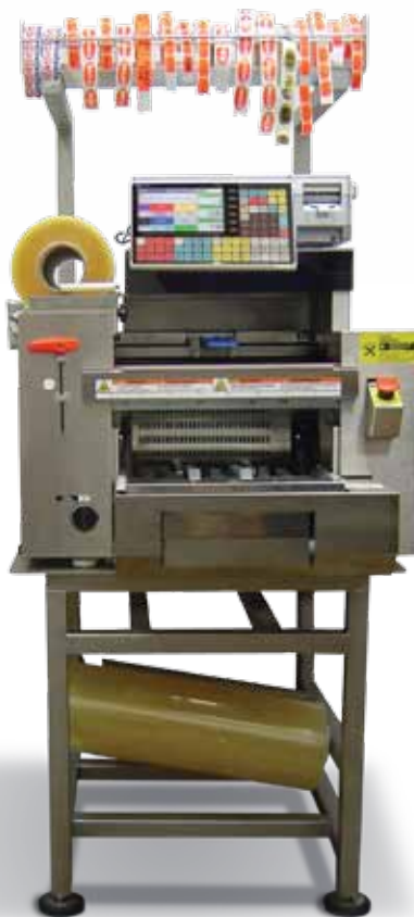
Shown with options: stand, film and POP label dispenser

Controlled by the Uni-7 price-computing scale and printer, the WM-Nano brings the same user interface right from the front counter to the back room, where operators won't have to learn another type of equipment.